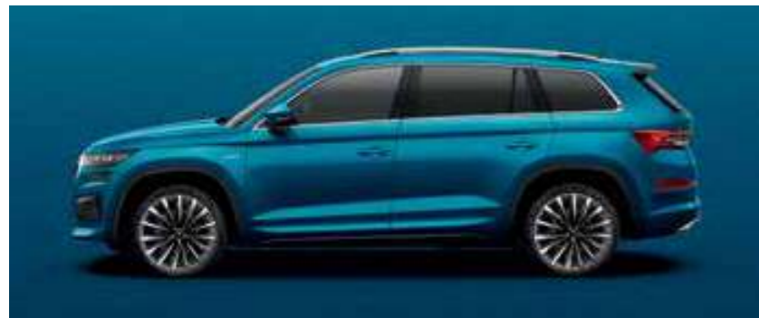
LAVA BLUE METALLIC