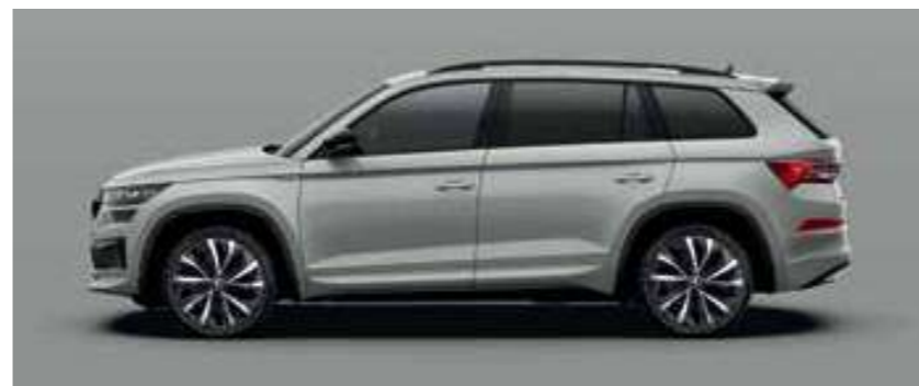
STEEL GREY METALLIC