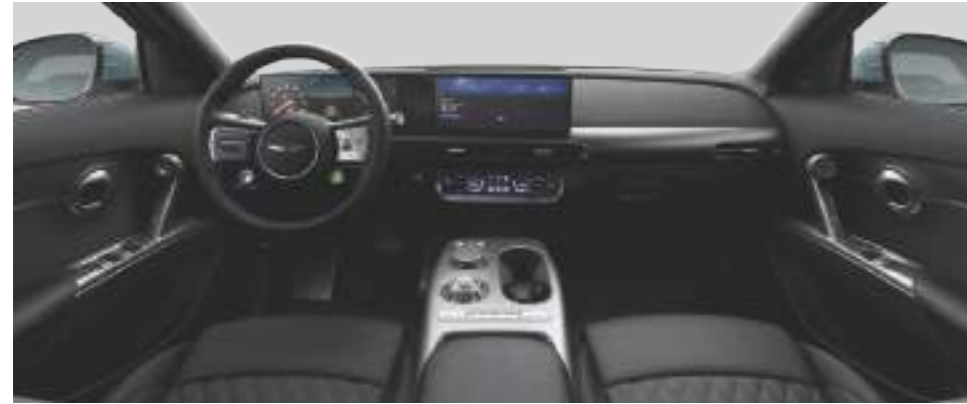
OBSIDIAN BLACK MONOTONE