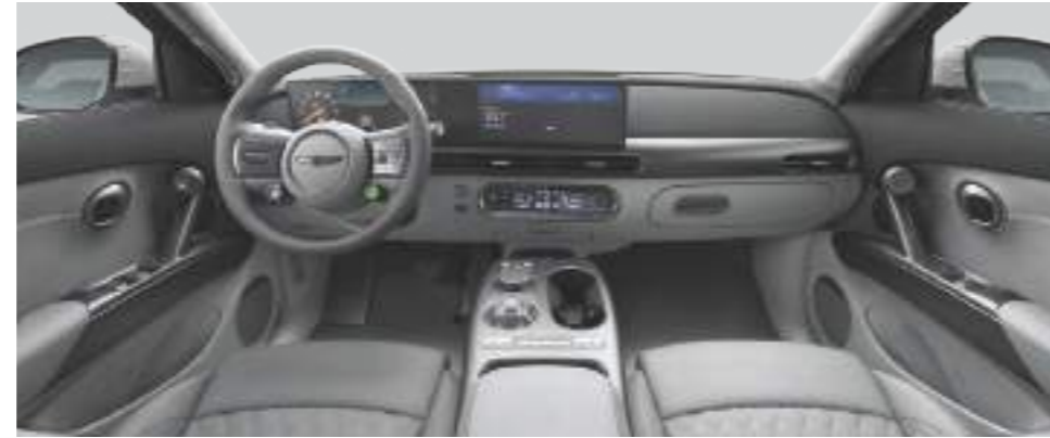
ASH GRAY AND GLACIER WHITE