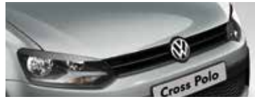
Reflex Silver Metallic 8E8E