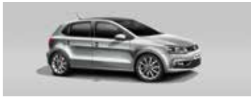
Reflex Silver Metallic 8E8E