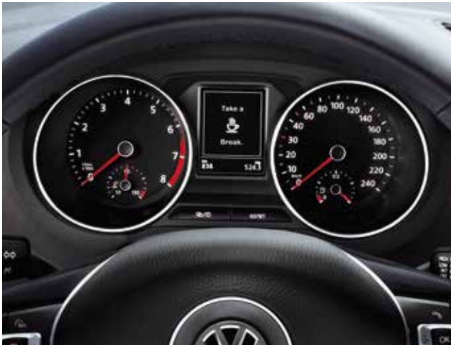
Fatigue Detection (standard on Highline) detects irregular driving patterns and warns you when it's time to take a break on a long drive.