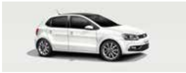
Pure White Non-Metallic 0Q0Q