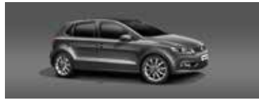
Pepper Grey Metallic U5U5