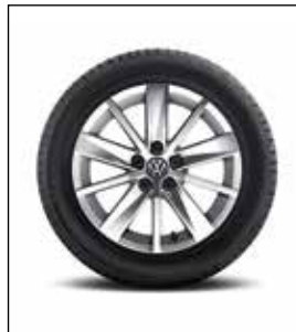
15" Tosa alloy wheel (Standard on the Comfortline)