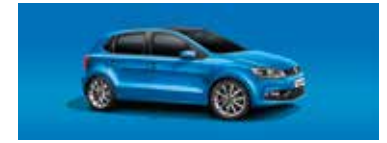
Cornflower Blue Non-Metallic D7D7