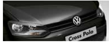
Deep Black Pearlescent 2T2T