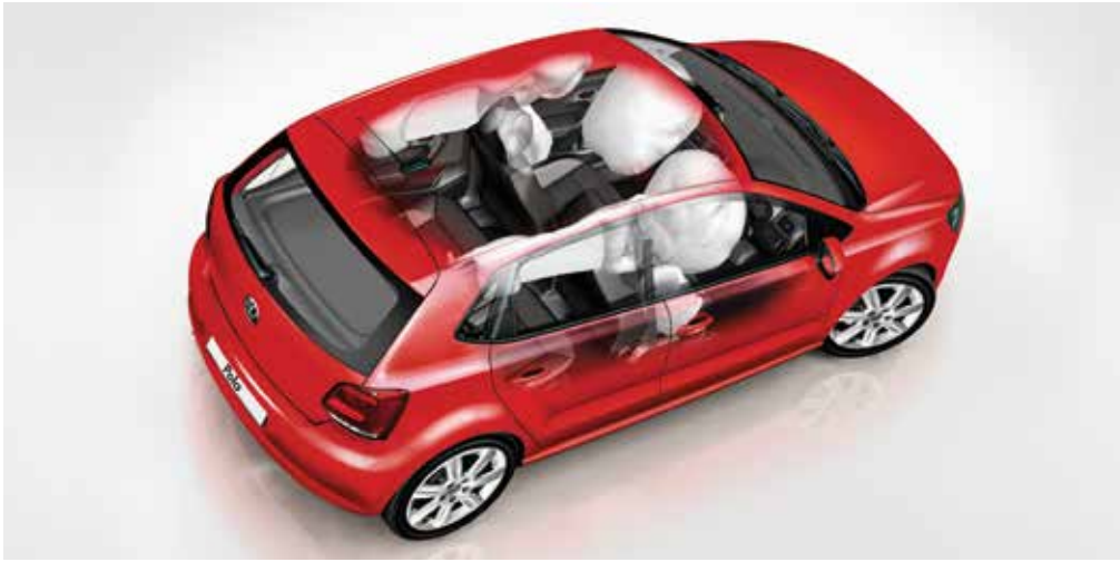
The advanced airbag system features two side airbags as well as driver and front passenger airbags with front passenger airbag deactivation.