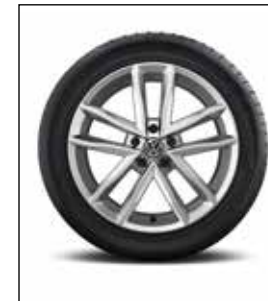
17" Mirabeau alloy wheel (Optional on Highline)