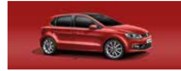
Sunset Red Metallic 6K6K