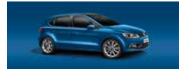
Blue Silk Metallic 2B2B