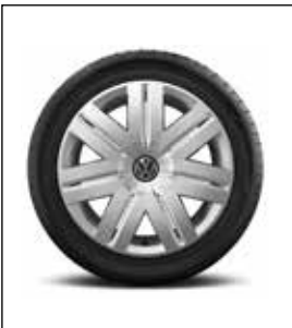
14" Steel alloy wheel (Standard on the Trendline)