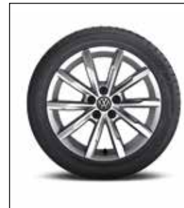
16" Portago alloy wheel (Standard on the Highline)