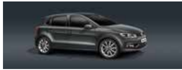
Urano Grey Non-Metallic 5K5K