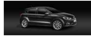
Black Non-Metallic A1A1