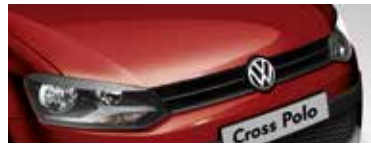
Sunset Red Metallic 6K6K