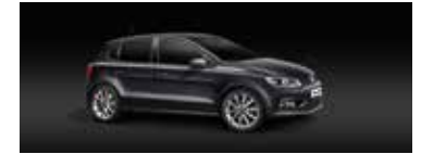
Deep Black Pearlescent 2T2T