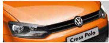
Honey Orange Metallic 4V4V