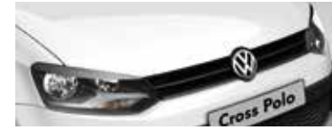
Pure White Non-Metallic 0Q0Q