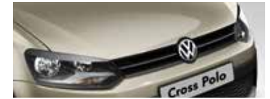
Titanium Beige Metallic 0N0N