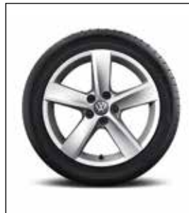
16" Rivazza alloy wheel (Optional on the Comfortline)