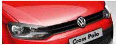
Flash Red Non-Metallic D8D8