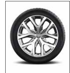
17" Canyon alloy wheel (Standard on Cross)