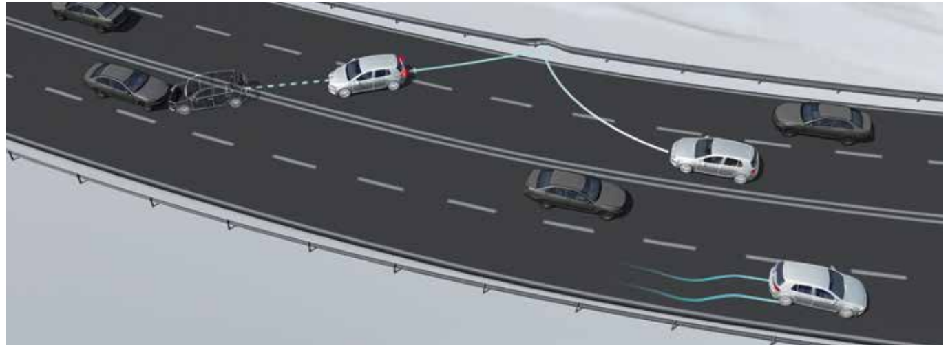
In the event of a primary collision, the Multi-collision Braking System automatically activates, braking the vehicle and slowing it down to a defined minimum speed within the driving dynamic limits controlled by the ESC head unit, which can prevent subsequent crashes.