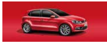
Flash Red Non-Metallic D8D8