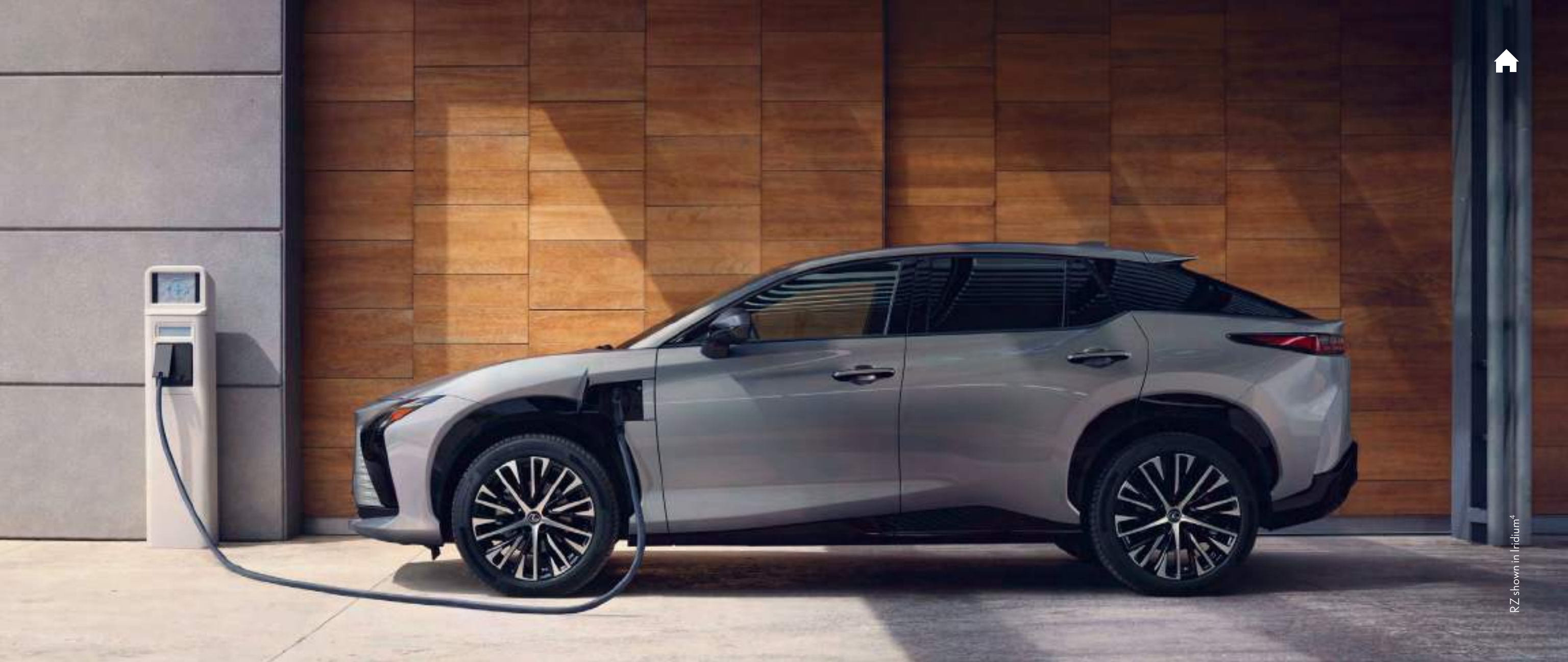
RZ shown in Iridium 4