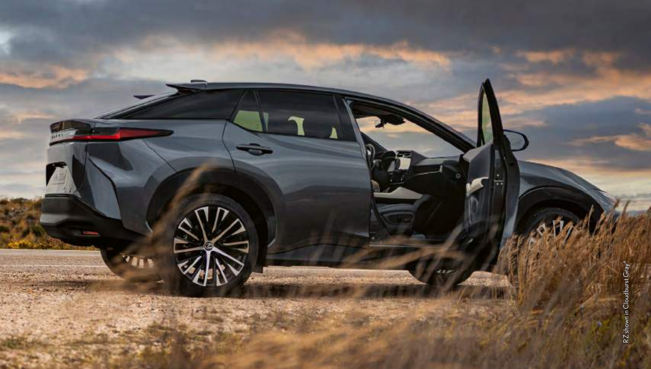
RZ shown in Cloudburst Gray 4