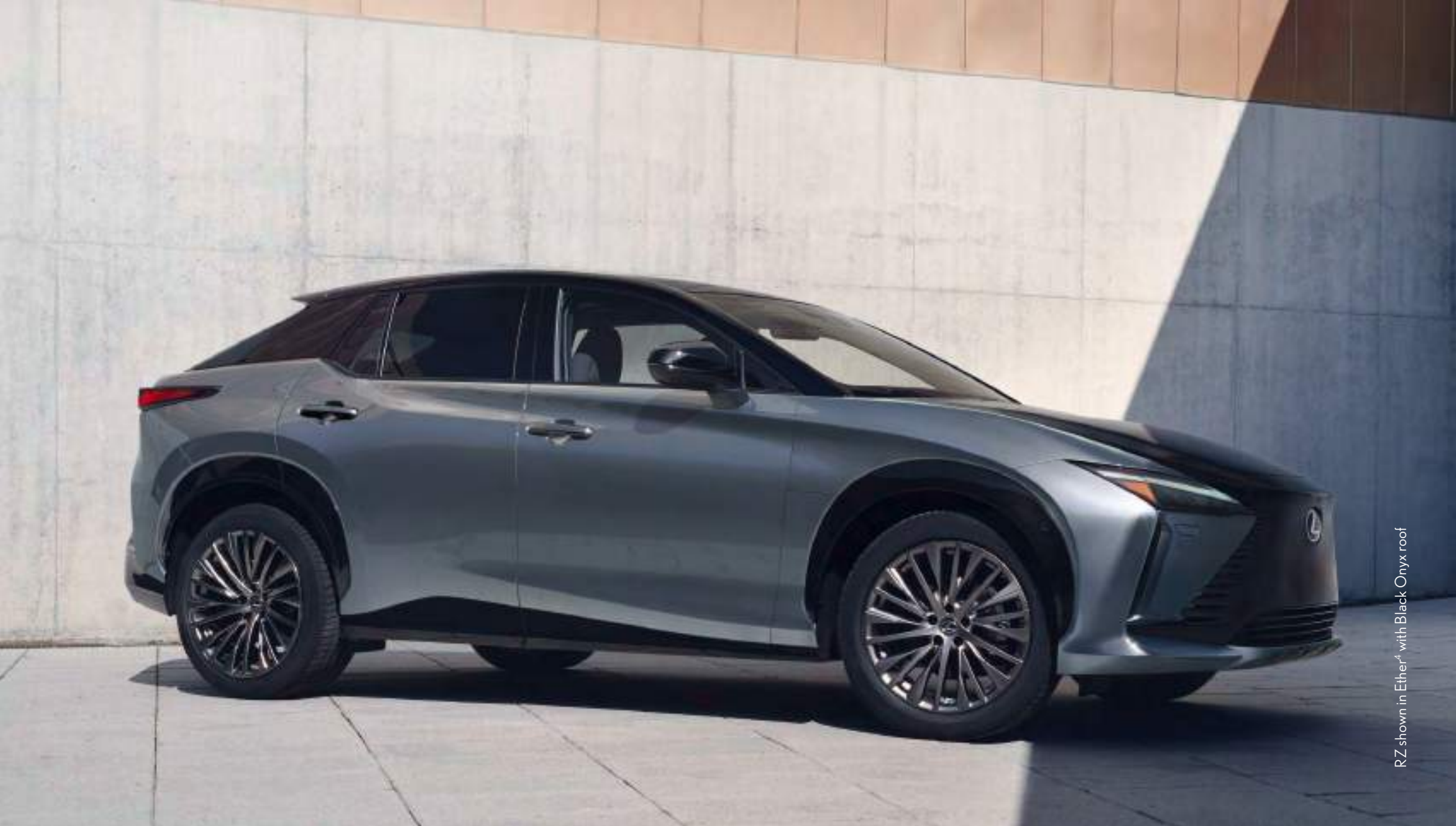
RZ shown in Ether 4 with Black Onyx roof