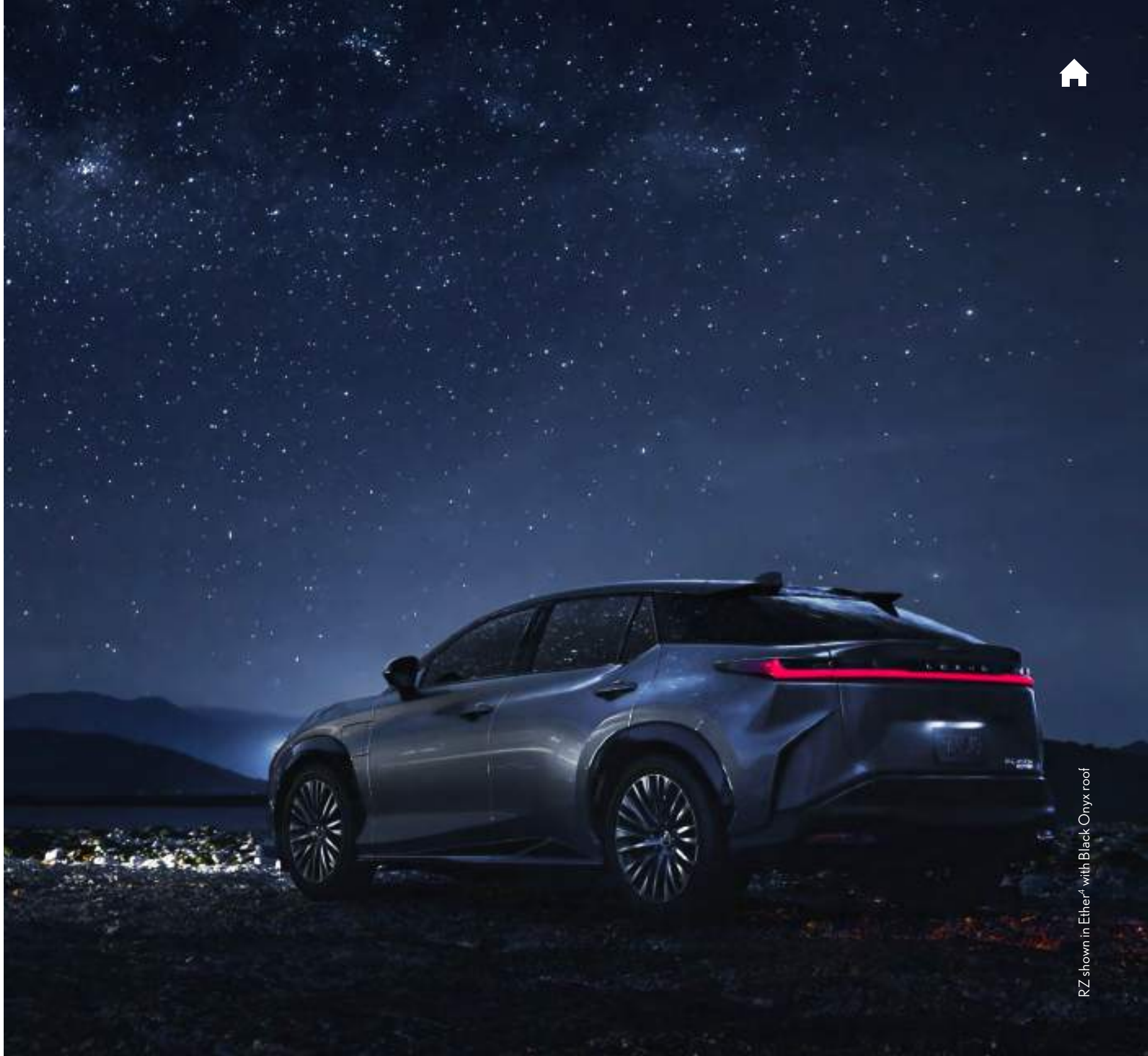
RZ shown in Ether 4 with Black Onyx roof