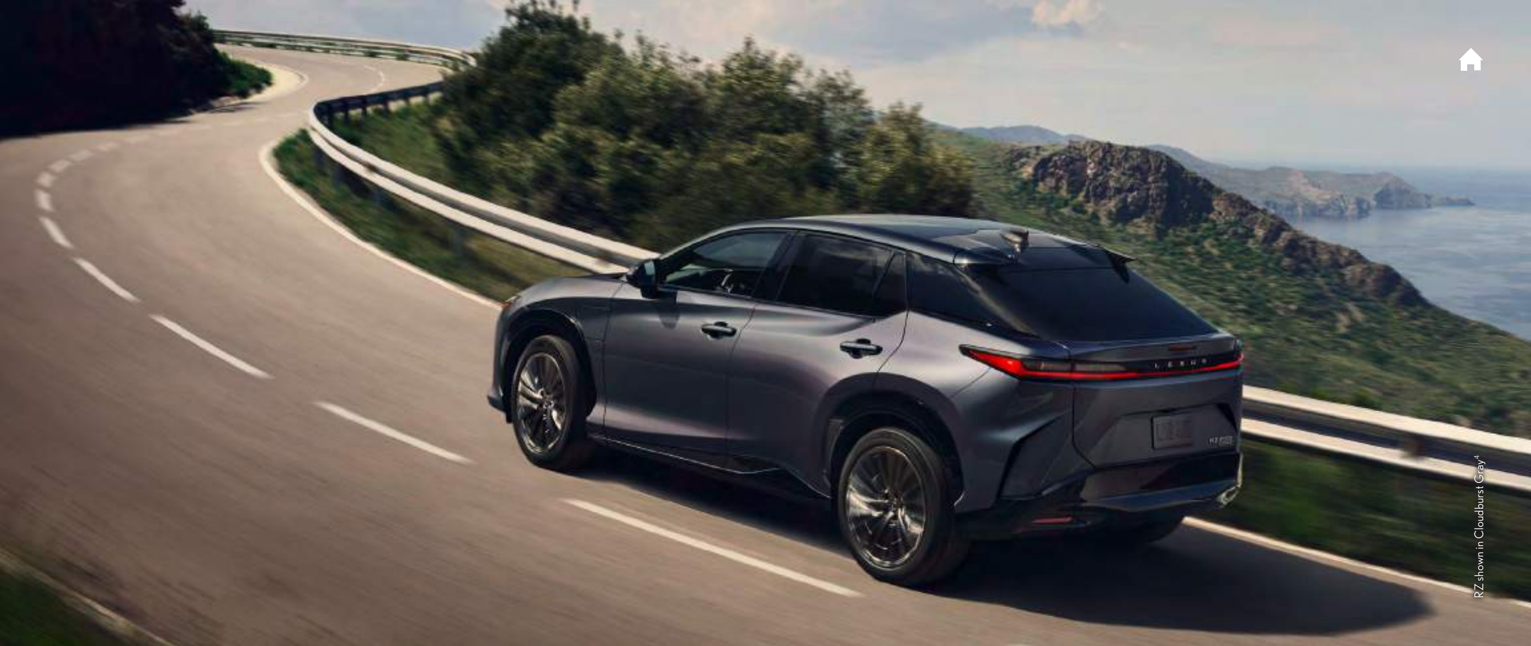
RZ shown in Cloudburst Gray 4