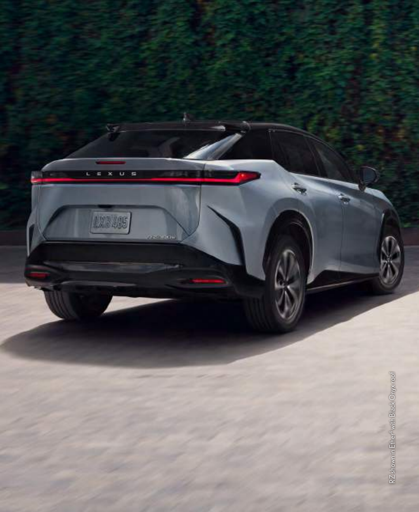
RZ shown in Ether 4 with Black Onyx roof